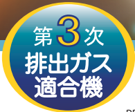
PDS900VRSD [Dry Air Type]